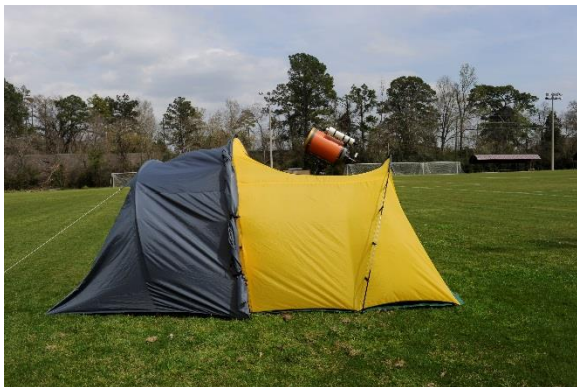
C-11 mounted up on Losmandy G-11 mount and ready to observe at alocal County Park.

Obviously, I will have more room to view when I use the C-11 and FC-100 OTA's.