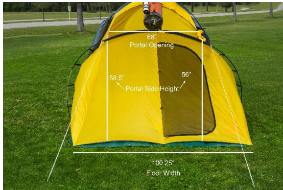
End view of Stargate II Tent showing the width of the tent and the width of the observing portal opening.

The doors are large enough to carry the Losmandy G-11 field tripod into the observing section with the 12 inch extension and the tripod legs mounted and extend to my observing height for all three of my OTA's (C-11, 150mm SkyWatcher f/8 refractor and Takahashi FC-100 f/8 refractor). Remember to place protective pads under tripod legs to protect tent floor material from abrasion.