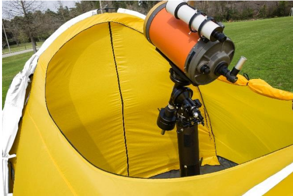
View of observing portal opened for viewing session...lots of room!

Even though the OTA is over 52 inches, when I am viewing at or near the horizon and say 30 degrees above, I have plenty of room along in the observing portal to observe through the eyepiece. The observing portal more than accommodates this OTA length plus me inside the walls of the tent.