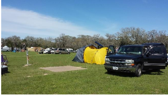
Houston Astronomical Society Observing Site 80 miles west of Houston.

permitting (which it didn't) and I brought everything including the kitchen sink I thought I might need or use. All that stuff ended up in the tent. In the observing room, I had my Losmandy G-11 mount/field tripod/Gemini 1 Level 4 controller and the telescope that I planned on using (either a C-11, 150mm StarWatcher Refractor or my Takahashi FC-100 Refractor). Around the perimeter of the observing area of the tent, I had 4 plastic tool/fishing boxes that house my eyepieces, adapters, etc. a box of food, two boxes of electrical gear, two 12V power supplies, small camp stove, ice chest, camp potty (sometimes tough to walk 300 yards to the Latrine ☺) and pneumatic observing stool. In the warm room area (sleeping bay) I had, backpacking sleeping pads, sleeping bag, pillows, extra clothes bag, jackets, and camping table (5' by 2") that had 3 laptop computers and a storage box on the top of the table. Under the table I had three large backpack style camera bags with cameras and astronomical gear. To give you an idea of the volume of space this actually takes up, consider a full size Chevy Suburban with the center seat folded down flat and the third seat folded over forward. The volume from the third seat to the back door is 80 cubic feet. That 80 cubic feet contained all of my gear. I put all that volume in the Stargate II tent with lots of room left to walk around