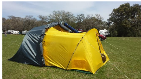
150mm f/8 SkyWatcher on Losmandy G-11 mount and tripod at Houston Astronomical Observing Site 80 miles west of Houston, Texas.

As you can see in the image to the left, I have setup the 150mm f/8 SkyWatcher Refractor on top of the Losmandy G-11 mount and field tripod in the center of the observing portal. The observing section and portal will easily accommodate a Fork Mounted C-14 or larger SCT. The footprint of my Celestron C-14/C-11 Wedge is not that much larger than the Losmandy G-11 mount. A larger Newtonian OTA with a tube length 60 to 70 inches would also be at home in the Stargate II tent. I had no problem moving around the telescope to view objects at the horizon and/or zenith. While I was aware of what was at my feet, I had plenty of room to maneuver. I never felt cramped or closed in and I wasn't tripping over my gear and/or power cords. 2 to 3 people could be in the observing section and not trip over each other. In the sleeping/warm room area, I was more than comfortable. My wife, Vicky could have been in her sleeping bag next to me and we would still have had ample room to be comfortable.