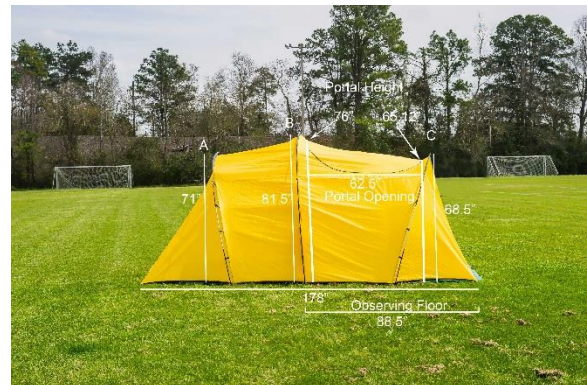
Side view of the Stargate II Tent showing length and height of tent and side dimension of portal window.

I liked the size, color and appearance of the tent from the start.